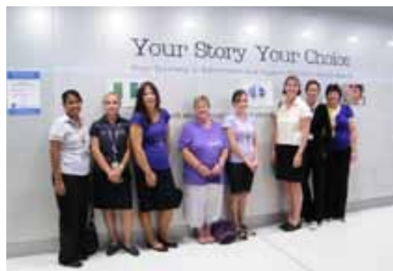
Some members of the Sexual Assault Regional Response Group who organised the exhibition